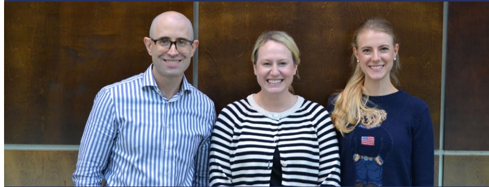
American Academy of Pediatric Dentistry (AAPD) and the AAPD Foundation in partnership with CareQuest Institute for Oral Health Scholars