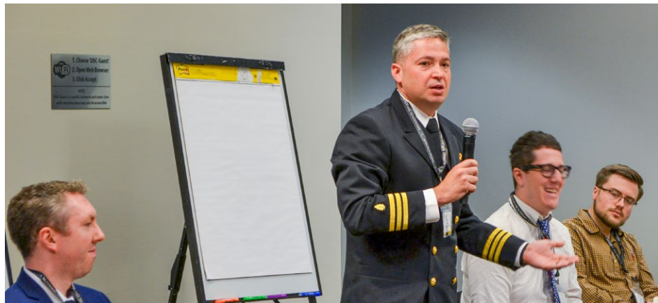
Faculty members work together to design rigorous learning objectives using Bloom's Taxonomy, developing assessment strategies that align with educational outcomes and provide meaningful feedback to enhance student performance.