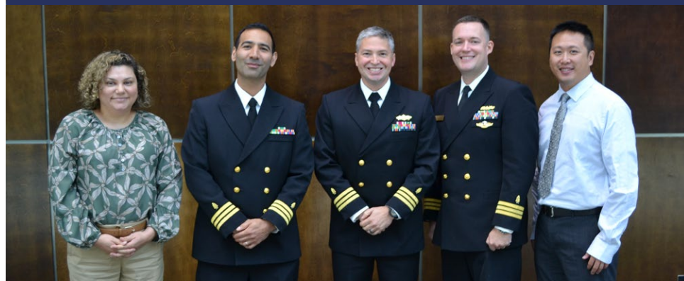
Uniformed Services Scholars