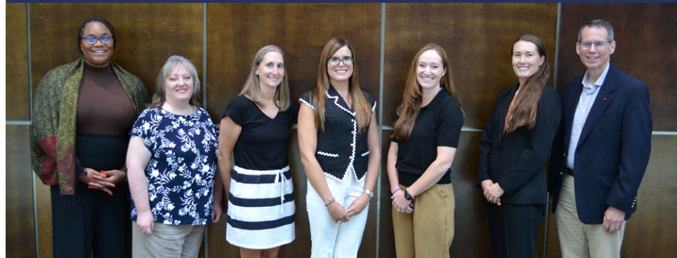
American Dental Association's Council on Dental Education and Licensure (ADA CDEL)