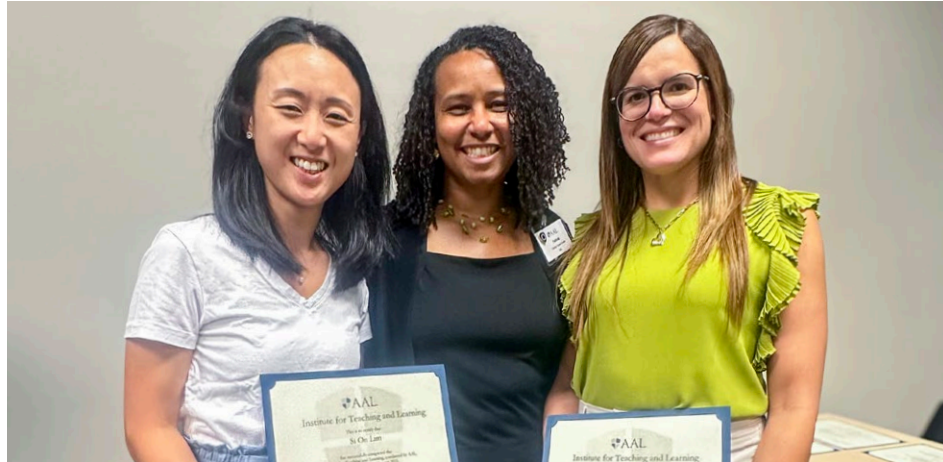
Scholarships were awarded to several attendees from various institutions, recognizing their contributions to dental education.