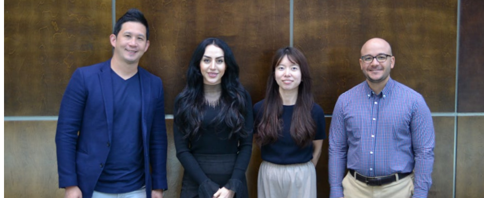
American Academy of Periodontology Foundation (AAP Foundation) Scholars