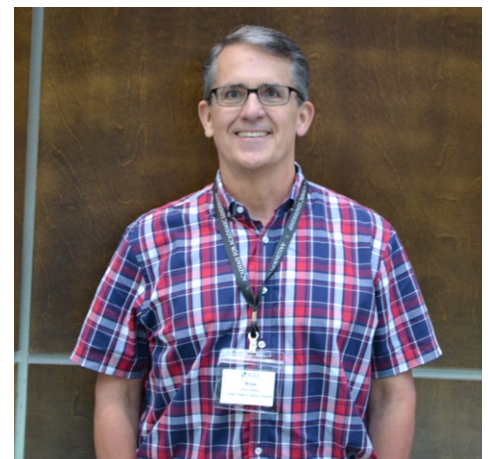
American Association of Orthodontists Council on Orthodontic Education (AAO COE) Scholar