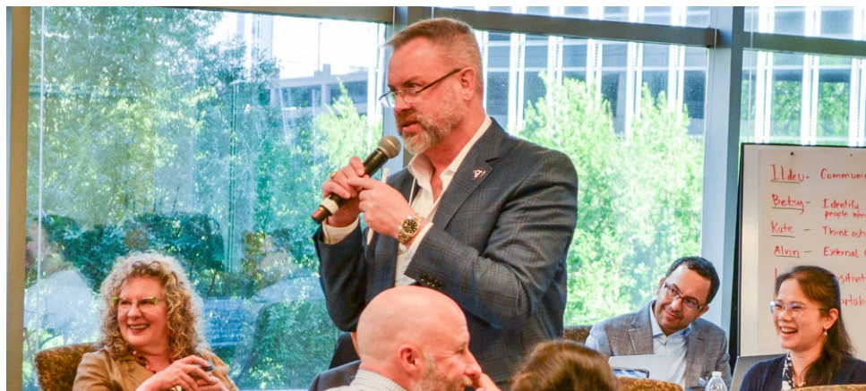
Case-based learning tackles the intersection of clinical operations and academic leadership: faculty practice plan challenges, clinical training site agreements, and balancing productivity expectations with educational excellence.