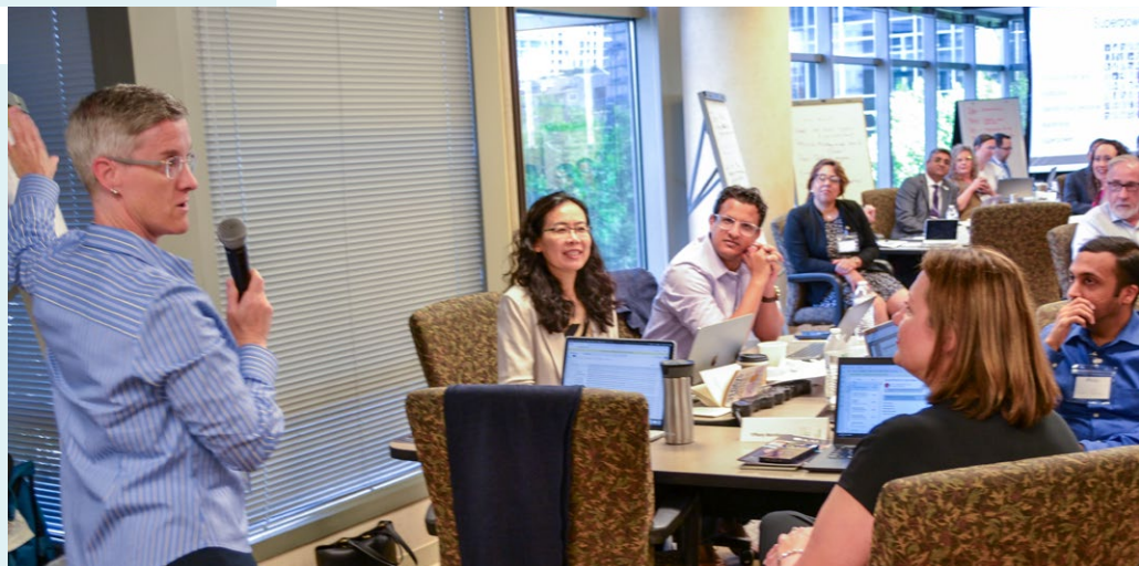
Small group discussions allow participants to explore how different health professions approach similar challenges, for example, pharmacy chairs learn from dental program directors, veterinary deans share insights with medical department chairs.

of participants reported strategic leadership and results-driven communication topics encouraged their creative and critical thinking